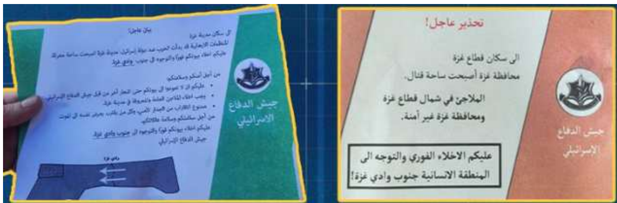
Letters from IDF to civilians in northern Gaza, suggesting to evacuate south

Throughout this campaign, Israel has issued repeated warnings for civilians in Gaza to evacuate defined areas, ahead of impending strikes. Many critics have charged that this amounts to 'forced displacement', which is a violation of international humanitarian law and a crime against humanity, pursuant to Article 7 of the Rome Statute . However, this is highly erroneous and a gross misinterpretation of both the law and Israel's intentions in providing such warnings.