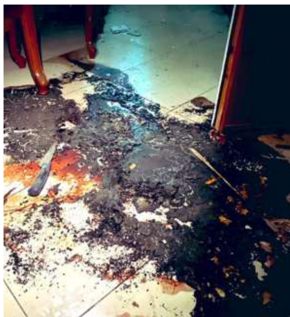
Bloodstained room in Kibbutz Be'eri, Southern Israel.

In short, what Hamas is carrying out is a triple war crime: using civilians in Gaza as human shields to attack civilians in Israel, while seeking the destruction of the Jewish state.